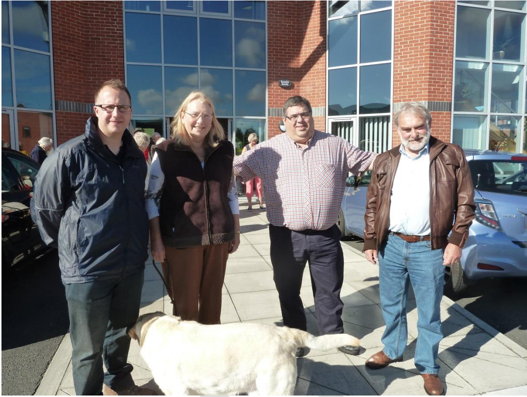
Members of the Scrutiny Task Group setting out on a Health Walk in St Peters, Worcester.